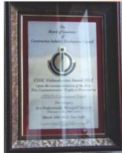
CIDC Vishwakarma Award 2012 for 'Best Professionally Managed Company' and CIDC Vishwakarma Award 2017 for Best Construction Project for Railways Coach Factory, Rae Barely.