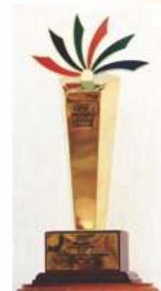
India Pride Award 2013