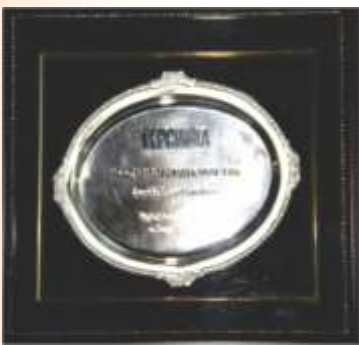
'EPC India Award' for Special Contribution for Highest Growth in Exports as a Large Enterprise