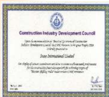
Progress Trophy 2018 for CSR contribution in Skill India