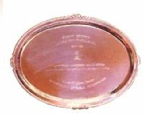
'Institute of Economic Studies Excellence Award' from Department of Public Enterprises