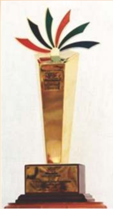
India Pride Award 2015

CIDC Vishwakarma Award 2015 for 'Best Professionally Managed Company'