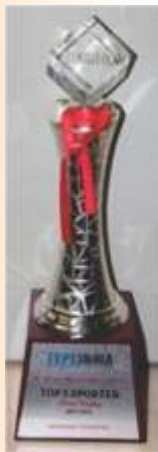
All-India 'Export Excellence' Award' of EEPC INDIA for 2011-12

These achievements are a showcase the dedication & commitment displayed by our employees & serve as a beacon of trust and unwavering commitment towards all our stakeholders. IRCON has consistently won the "Highest Foreign Exchange Earner Award" in the construction sector during the last decade.