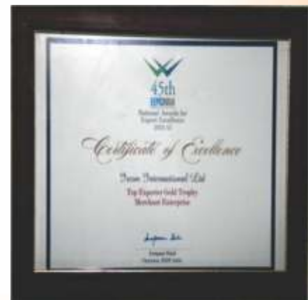
'EPC India National Award' for Excellence in Exports 2012-13