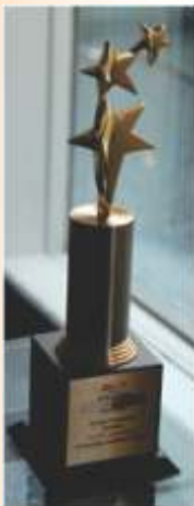
The 'Economics Times Infra Focus Award' for Excellence