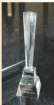
Dun & Bradstreet's Infra Award 2017