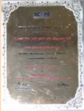
SCOPE Meritorious Award 2012-13 for 'Corporate Social Responsibility & Responsiveness'