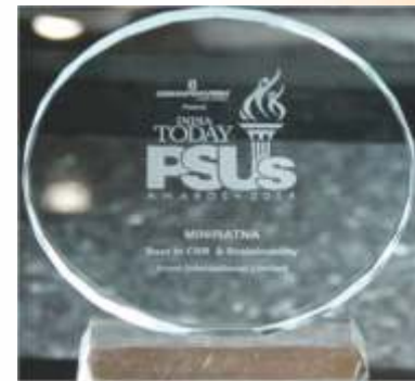
Best PSU award 2012-13 for 'CSR & Sustainability' from India Today Group