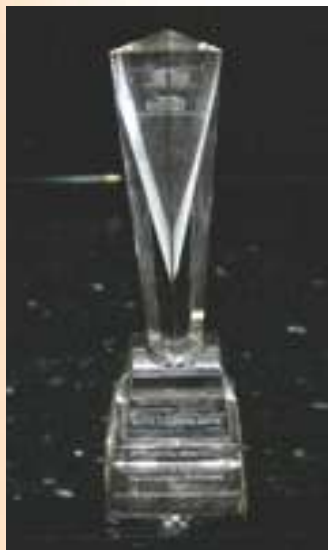
Dun & Bradstreet's Infra Award 2015

Dun & Bradstreet's Infra Award 2016 For "Best Infrastructure Project: Setting up of Rail Coach Factory, Rae Bareli at Lalganj (U.P.)